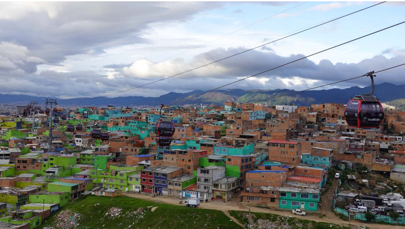
Olga Lucia Sarmiento, 2023

Key: Yes ✓ No ✗ Mixed ✓/✗ Not applicable -